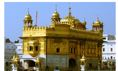
The Golden Temple of the Sikhs in Amritsar