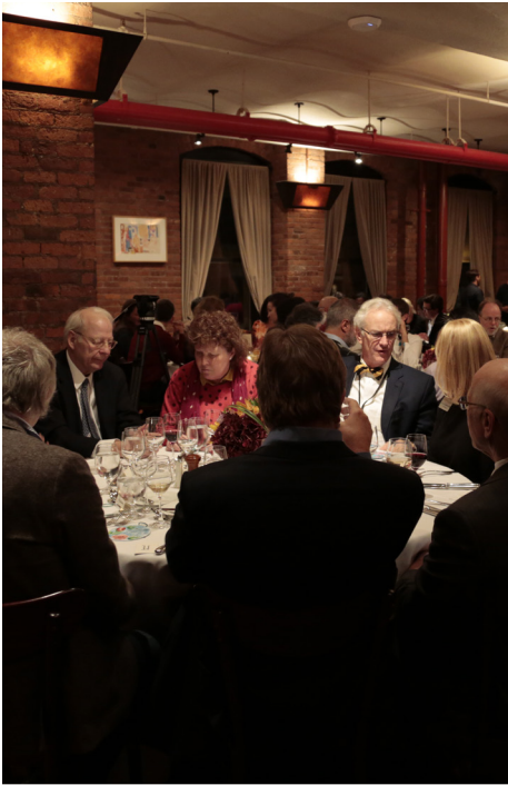
Journalists from around the world.